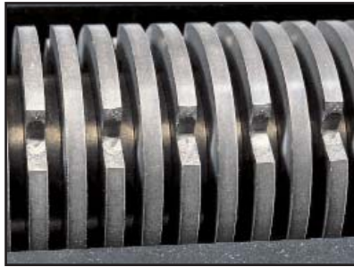
The special groove form of the cutting and perforation rollers ensures particularly effective padding.