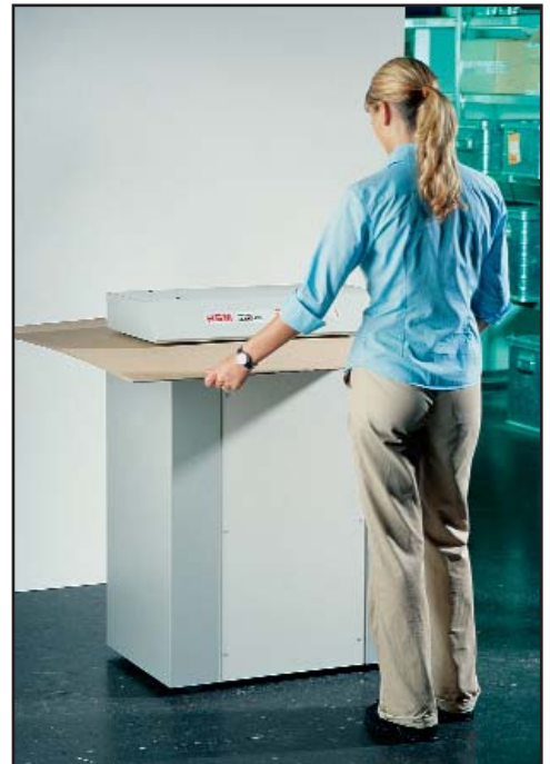
Simple handling -- also suitable for large cardboards without first cutting to size.