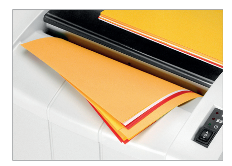
Anti-paper jam function

The operation is very easy: the device starts automatically when fed paper and automatically stops after shredding is complete.