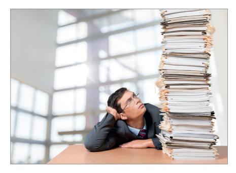
For continuous operation

The powerful motor ensures a high cutting capacity and reliable continuous operation.