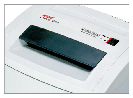
High level of user safety

The powerful motor ensures a high cutting capacity and reliable continuous operation.