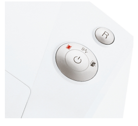
The full bin is indicated via the display and the machine switches off automatically.

The induction-hardened, solid steel cutting rollers guarantee durability.