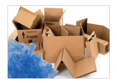
Compresses cardboard and film