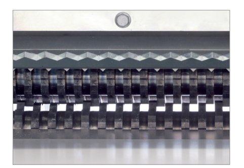
Durable and robust

Crusher rollers made of specially hardened and ground steel, completely resistant to wear and very strong, for a long service life.